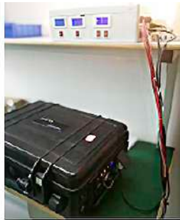
8.1 AC 220V output testing

Please use the original charger produce from the manufacturer, the max current for charger is 51.8V20A.