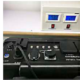
8.3 DC 48V output testing