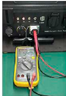
8.2 DC 48V output testing